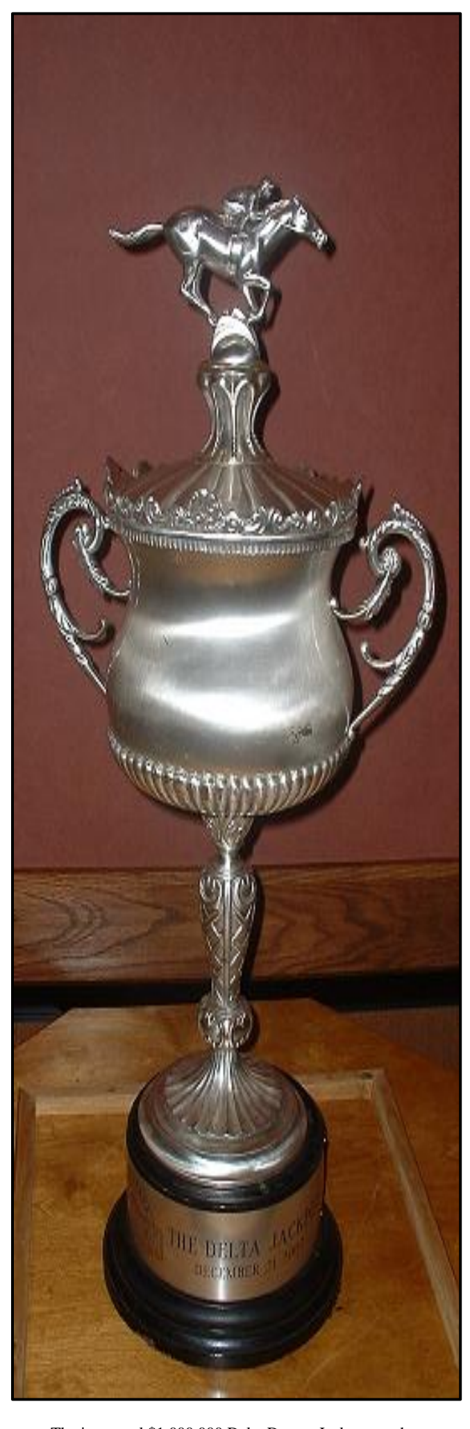
The inaugural $1,000,000 Delta Downs Jackpot trophy, on display in the Lookout Steak House daily.