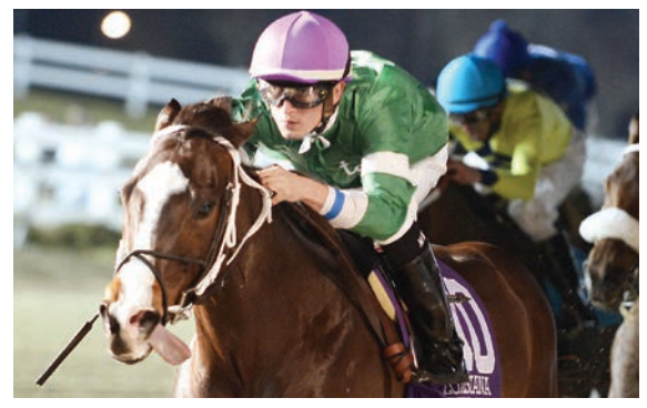
Su Casa G Casa, taking last year's LAPN Sprint

Heavy On Themister will have his work cut out for him if he is to break Star Guitar's record of four consecutive LAPN wins and over $1.7 million in career earnings, which is an all-time record for a horse bred in the Bayou State.