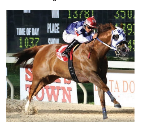
Zupers Quick Dash, winner of the Louisiana Classic in 2013