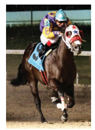
Fir Bread N Butter taking the 2013 Lee Berwick Futurity

Total stakes purse money in 2013: $1,053,355 • All Louisiana-breds • Post time: 6:15 p.m. CST