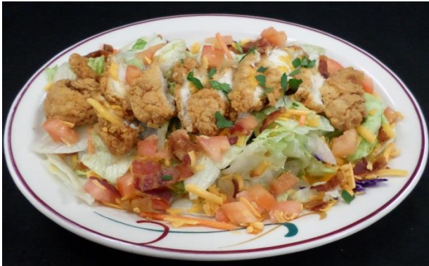
Crispy or Grilled Chicken Salad 6.99 Fresh mixed greens tossed with crispy fried chicken or grilled chicken breast topped with diced tomatoes, chopped bacon bits and shredded cheddar cheese