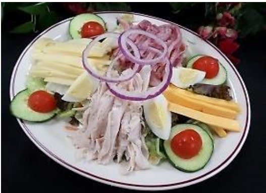
Chef's Salad New 7.49 Fresh mixed greens topped with julienne turkey, ham Swiss and American cheese sliced egg, cucumber and tomato