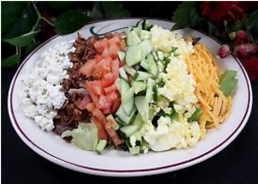
Cobb Salad New 7.99 Fresh mixed greens topped with breast of chicken, crisp bacon diced tomatoes, chopped hard boiled egg and bleu cheese crumbles