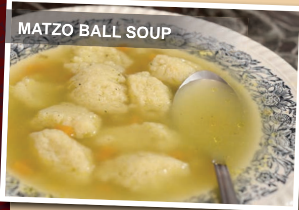
MATZO BALL SOUP