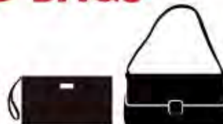
SMALL CLUTCH BAG/PURSE