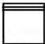
1 GALLON FREEZER BAG