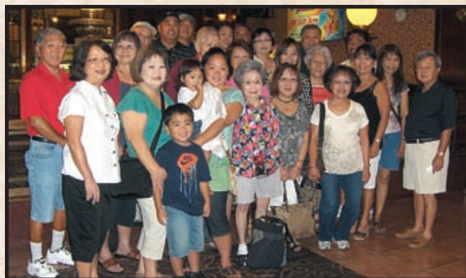
MIYAJI Family Reunion