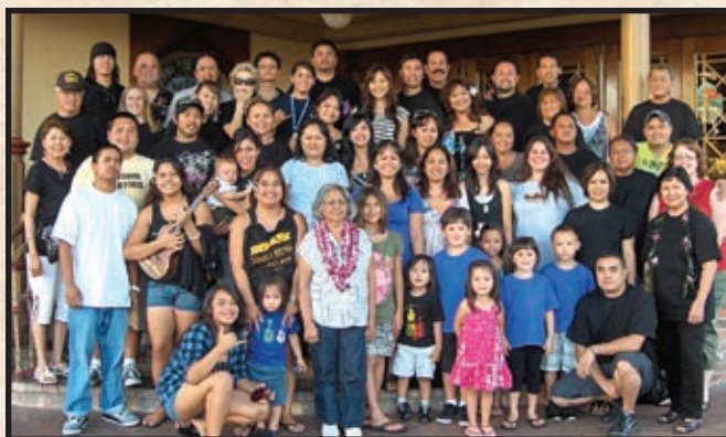
QUINTAL Family Reunion