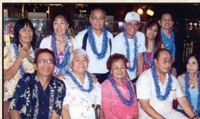
GULISAO-GOLISAO FAMILY Get Together