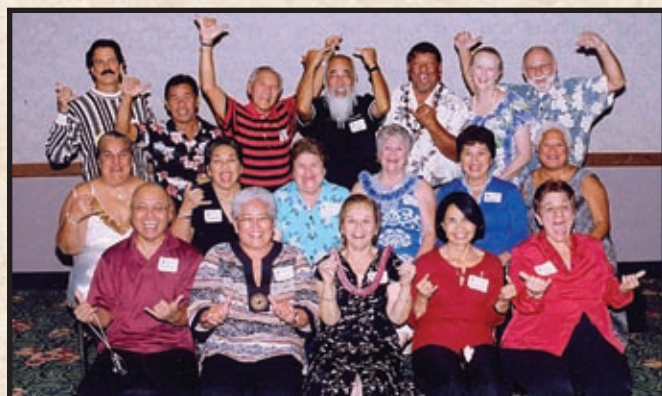
KAILU High School Class of 1963