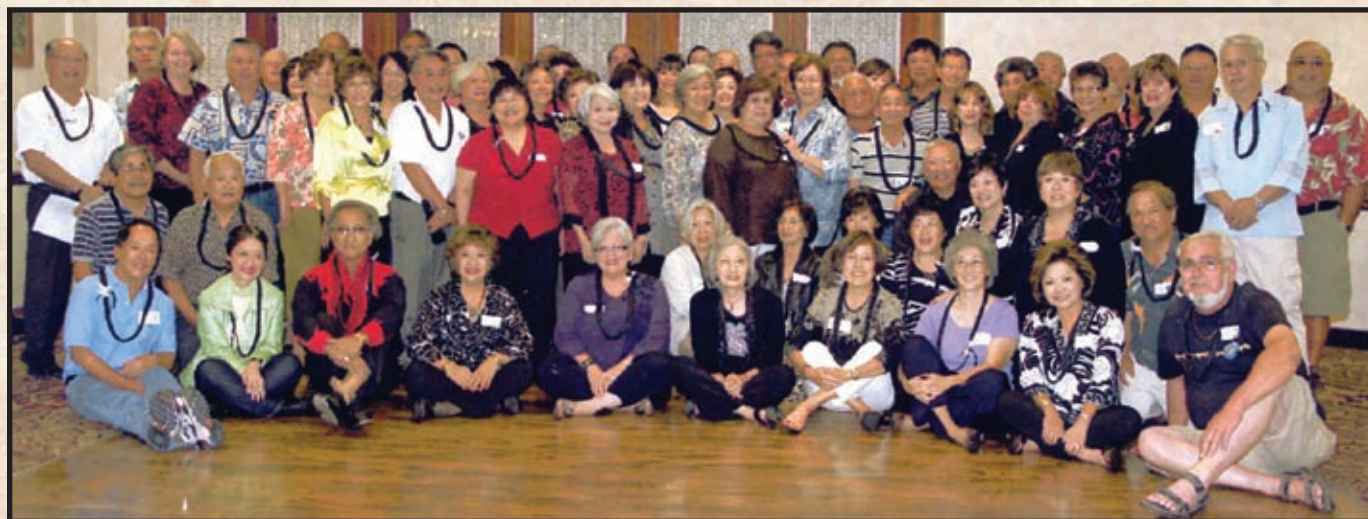
HILO High School Class of 1963