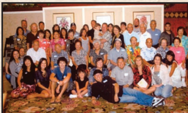
YOMOGIDA Family Reunion