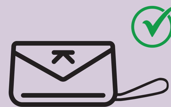
Clutch Bag w/ Wrist Strap

Clutch not to exceed 5" x 9" x 2" in size