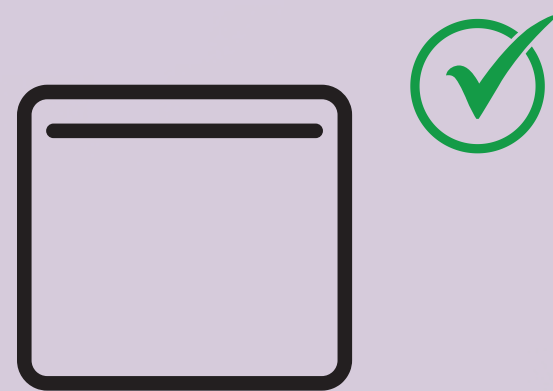
1 Gallon Freezer Bag