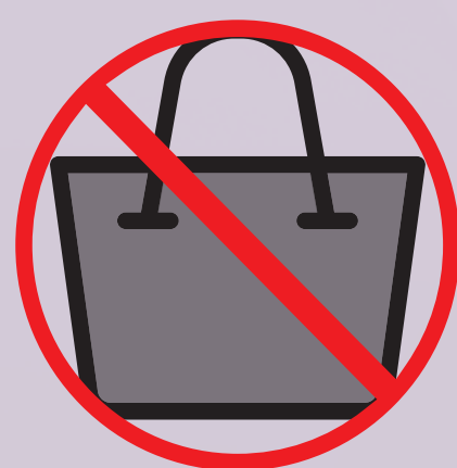
Tinted Plastic Bag