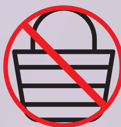
Printed Pattern Plastic Bag