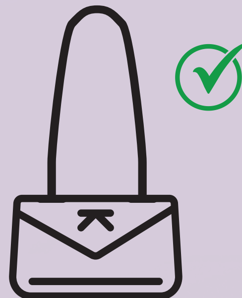
Clutch Bag w/ Shoulder Strap