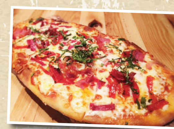
MEATLOVERS ITALIANO PIZZA

SHIITAKE MUSHROOMS, RED ONIONS, ROASTED PEPPERS, ROASTED ROMA TOMATOES, OLIVES, ARTICHOKES, ITALIAN CHEESE BLEND, FETA, PESTO SAUCE