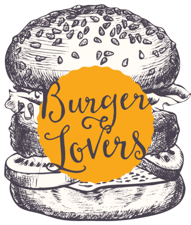
All burgers served with fries