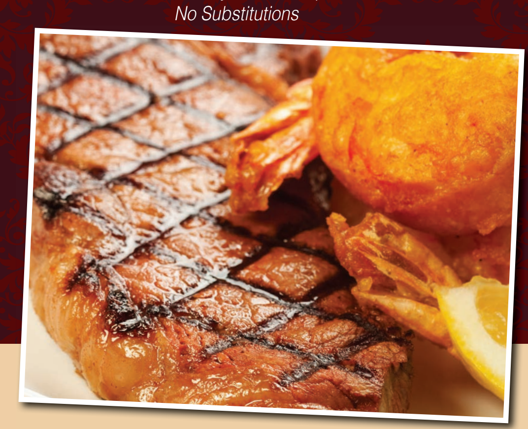
NEW YORK STEAK AND SHRIMP* 13.99 Seasoned and broiled to perfection, served with fantail shrimp, choice of potato and vegetable du jour